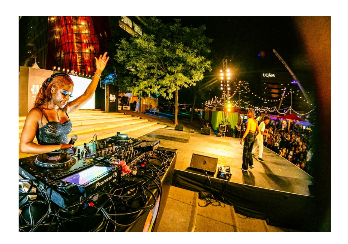
Musicians and DJs wanting to create unique and captivating atmospheres.