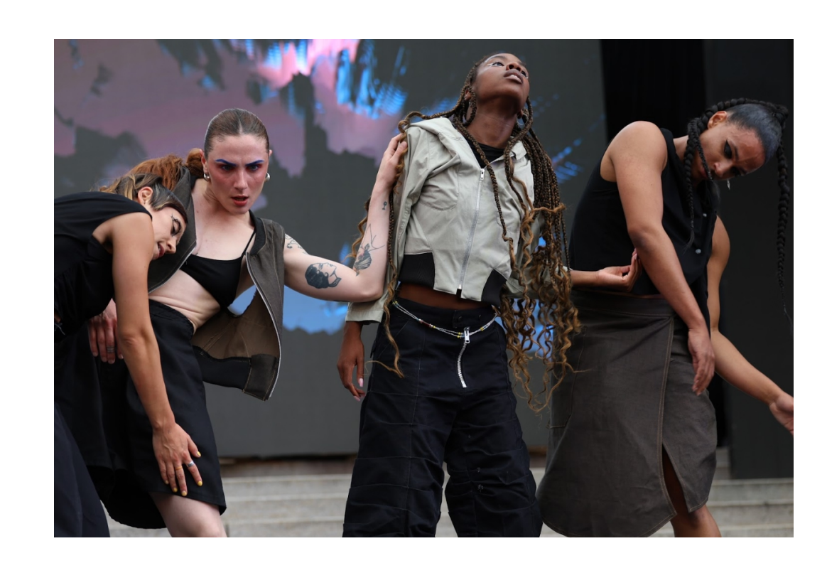
Fashion designers and trendsetters aspiring to reinvent the catwalk.

Ambitious creators aspiring to advance their careers on the national and international stage. Whether you're an emerging talent, have a team, a marketed project, performance experience, or a social media presence, these strengths will be highly valued — though they are not mandatory.