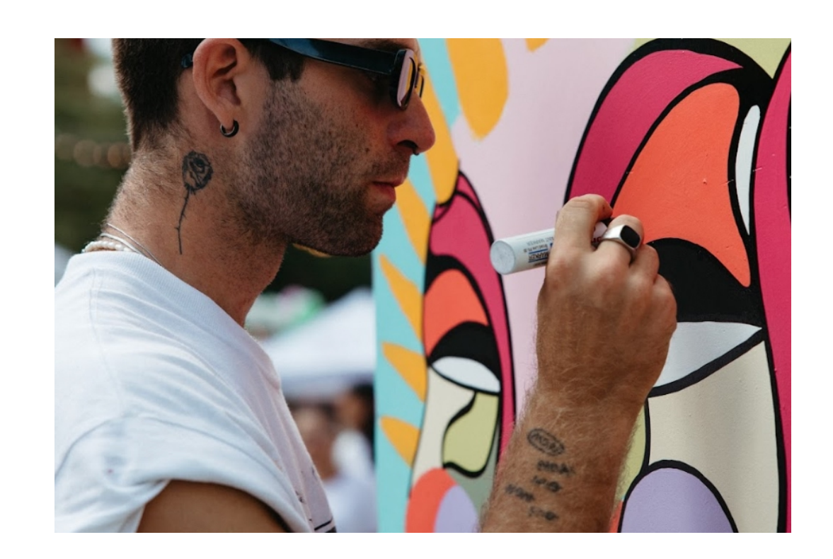
Visual artists, and multidisciplinary collectives seeking to exhibit artworks that defy conventions and stimulate reflection.

Visual artists, gallery owners, and multidisciplinary collectives aspiring to make their artistic mark on the world. Regardless of your current standing in the art scene, if you have a bold vision and a project that can captivate a broad audience, M.A.D. Festival is your stage. We value the diversity of expressions and encourage both emerging and established artists to submit their applications.