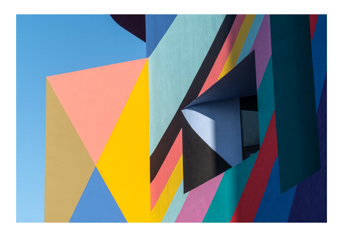
Gallery owners and art curators willing to present captivating and innovative collections.